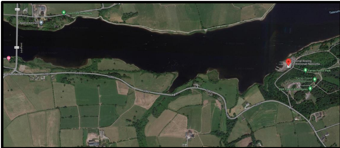
Location of National Rowing Centre (Aerial View)

The regatta is a two-day event to be held on Saturday 22 nd and Sunday 23 rd June 2024.