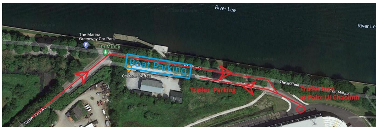
Figure 1 - Boat trailer parking plan

We are also planning that 2 or 3 smaller trailers will park on the road to Shandon Boat Club. We are asking you to get your trailers here early and drive past the clubhouse towards Pairc Uí Chaoimh where you can do a u turn and drive back up towards the clubhouse to park. Six trailer spots have been marked out to the East of the club. (See Figure 1)