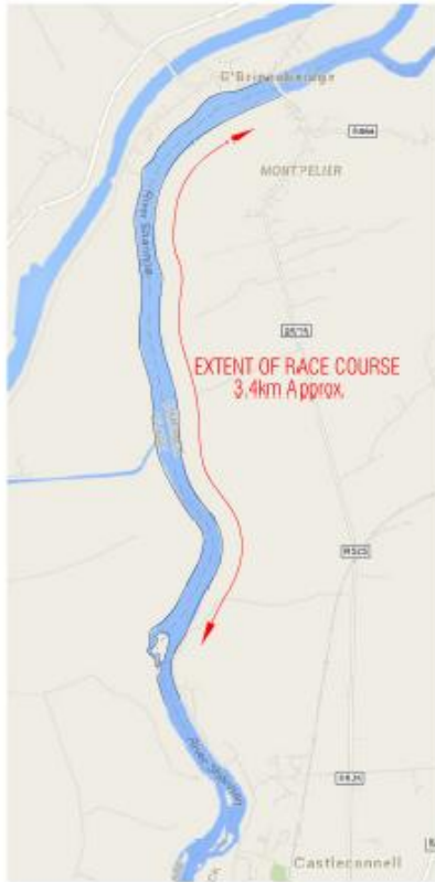
RACE COURSE OVERVIEW